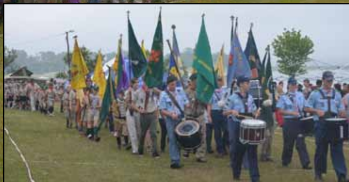
The 58th Durban Air Scout band leads the colour party onto the parade ground.